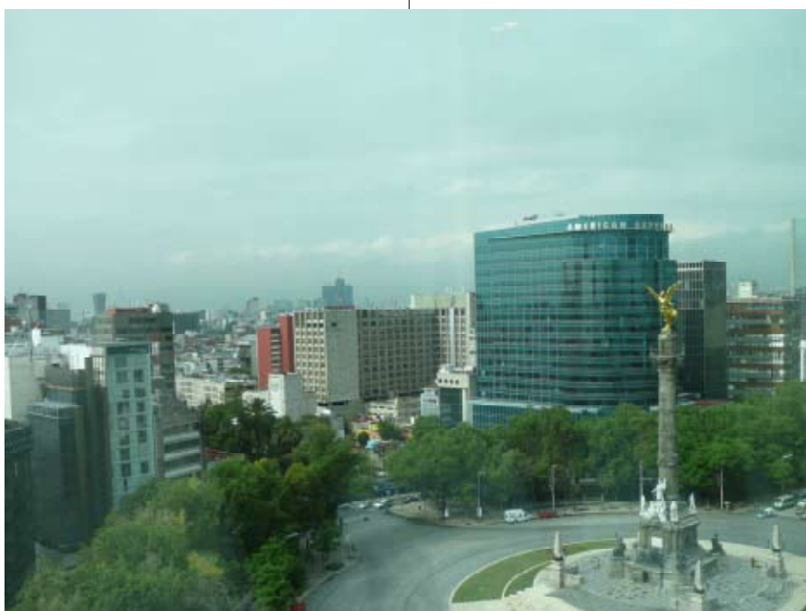
View of Mexico City

There are 53 Commonwealth countries around the world, 21 of which already have youth business programmes.