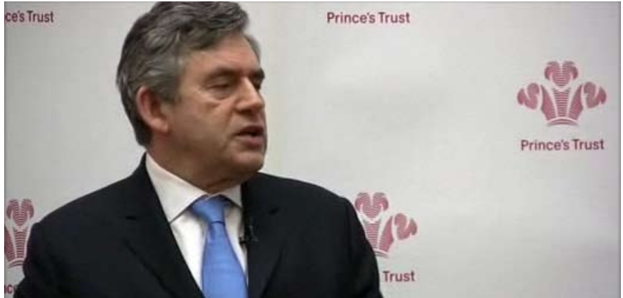
Gordon Brown, UK Prime Minister, addressing young people who have been supported by The Prince's Trust

The Prime Minister was asked several questions by the young people at the event about how the government plans to give further support to young people and help them get jobs.