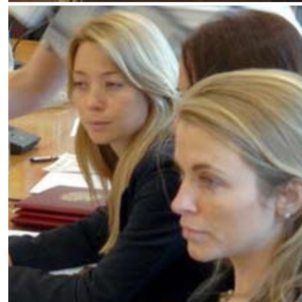
From top: Regional vice-governor, Regional minister of Youth, and Regional coordinator at the event in Kaluga